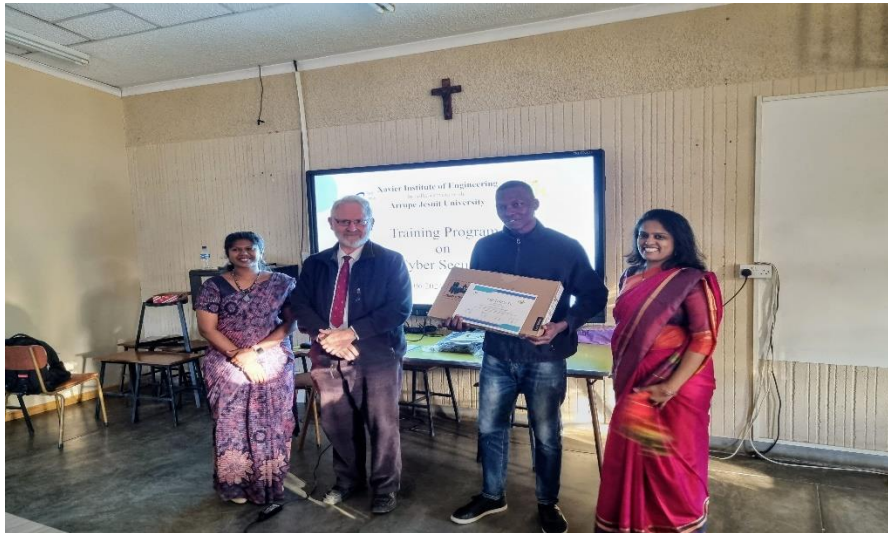
Winner Picture of the Roleplay and Assessment of Cyber Security Training