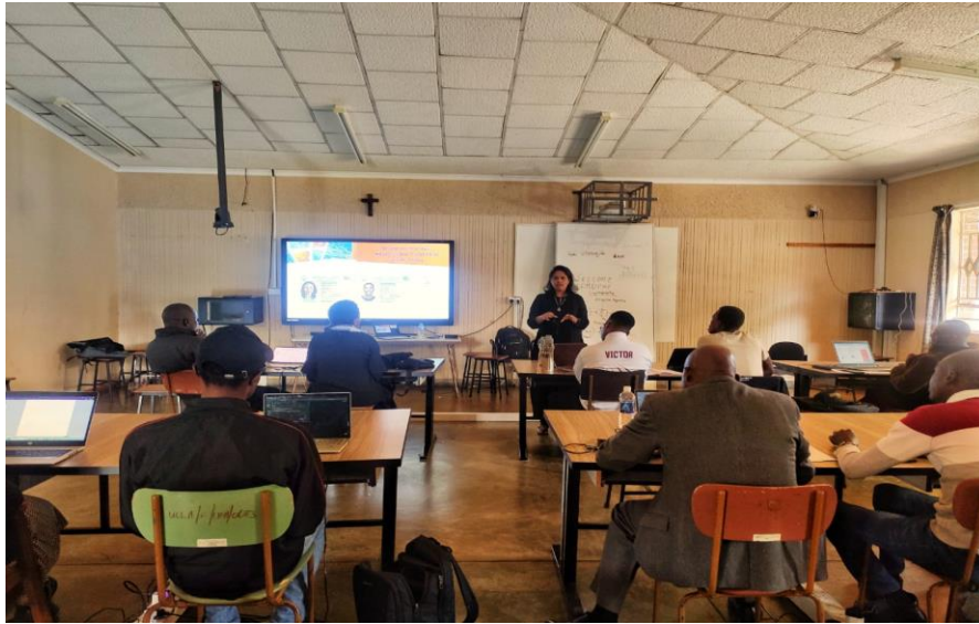
Session on Cyber Crimes in Zimbabwe