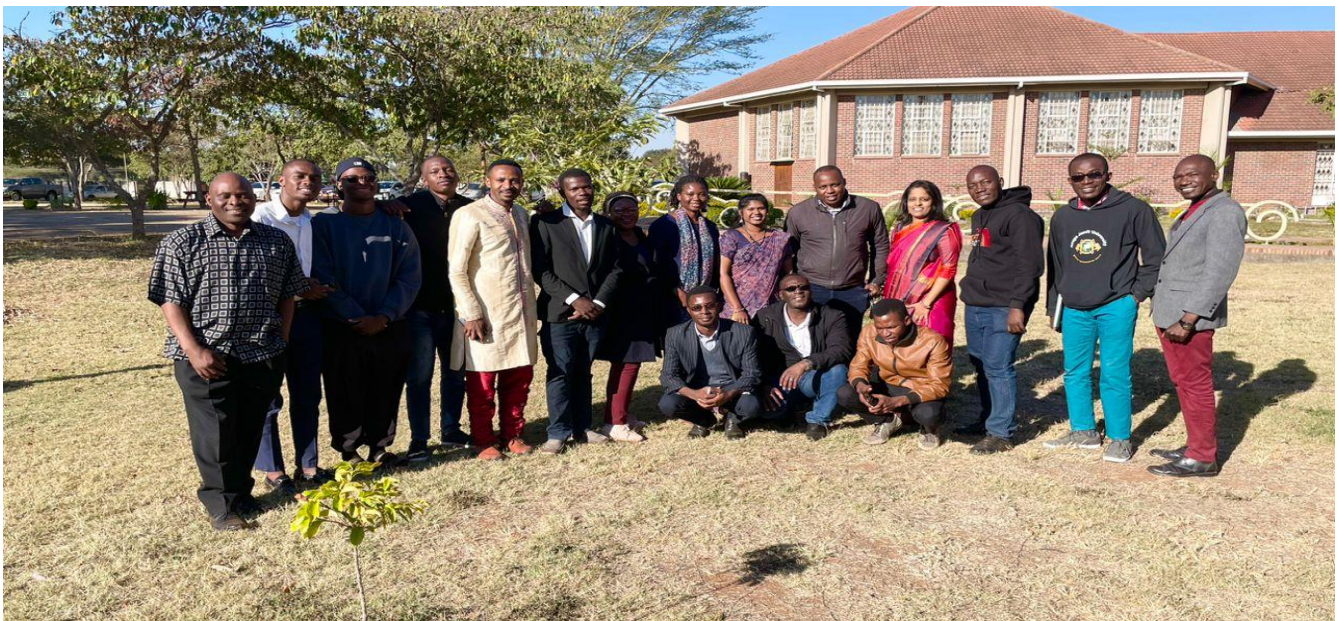
Cyber Security Training batch with Paticipants