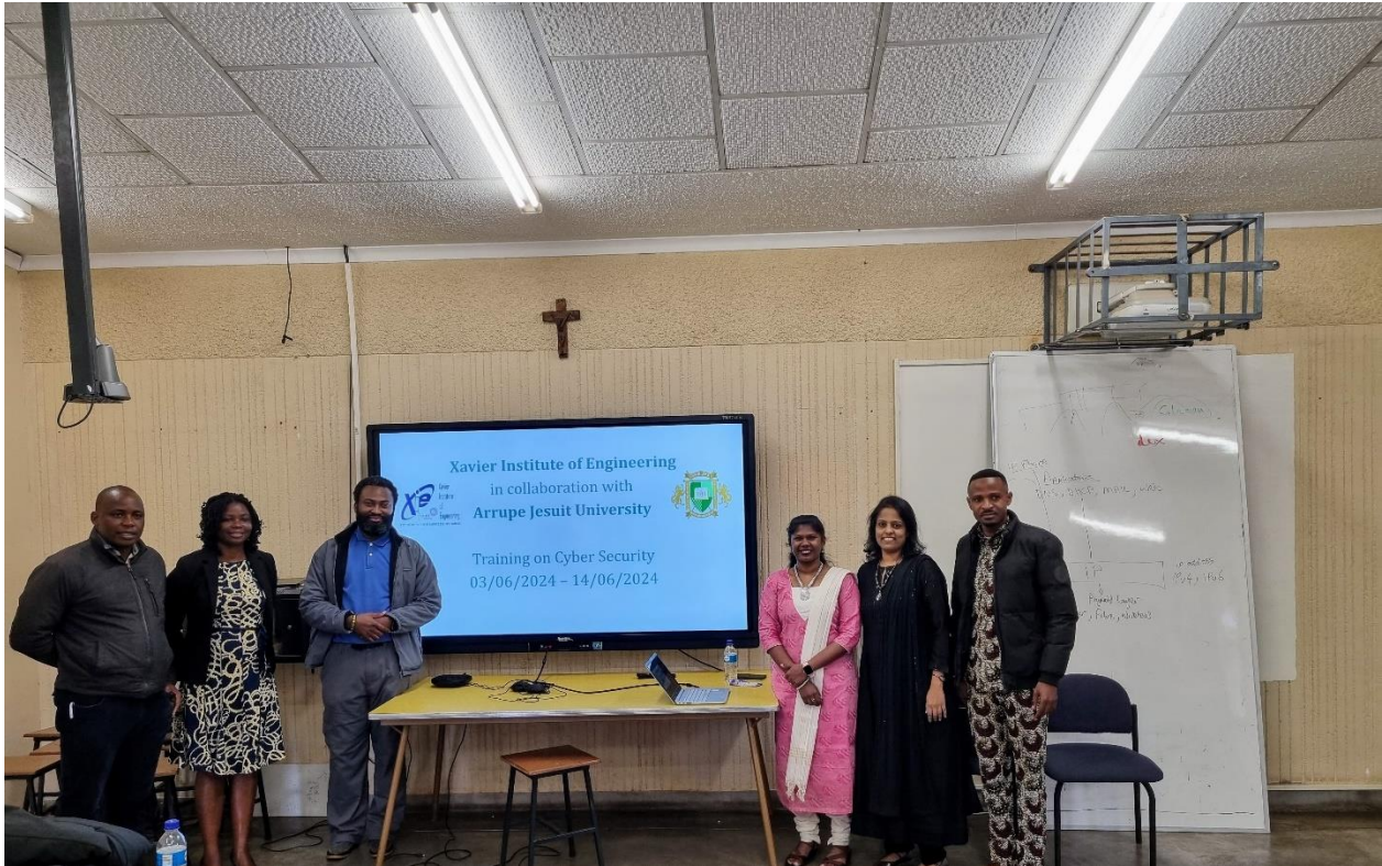
Innauguration of Cyber Security